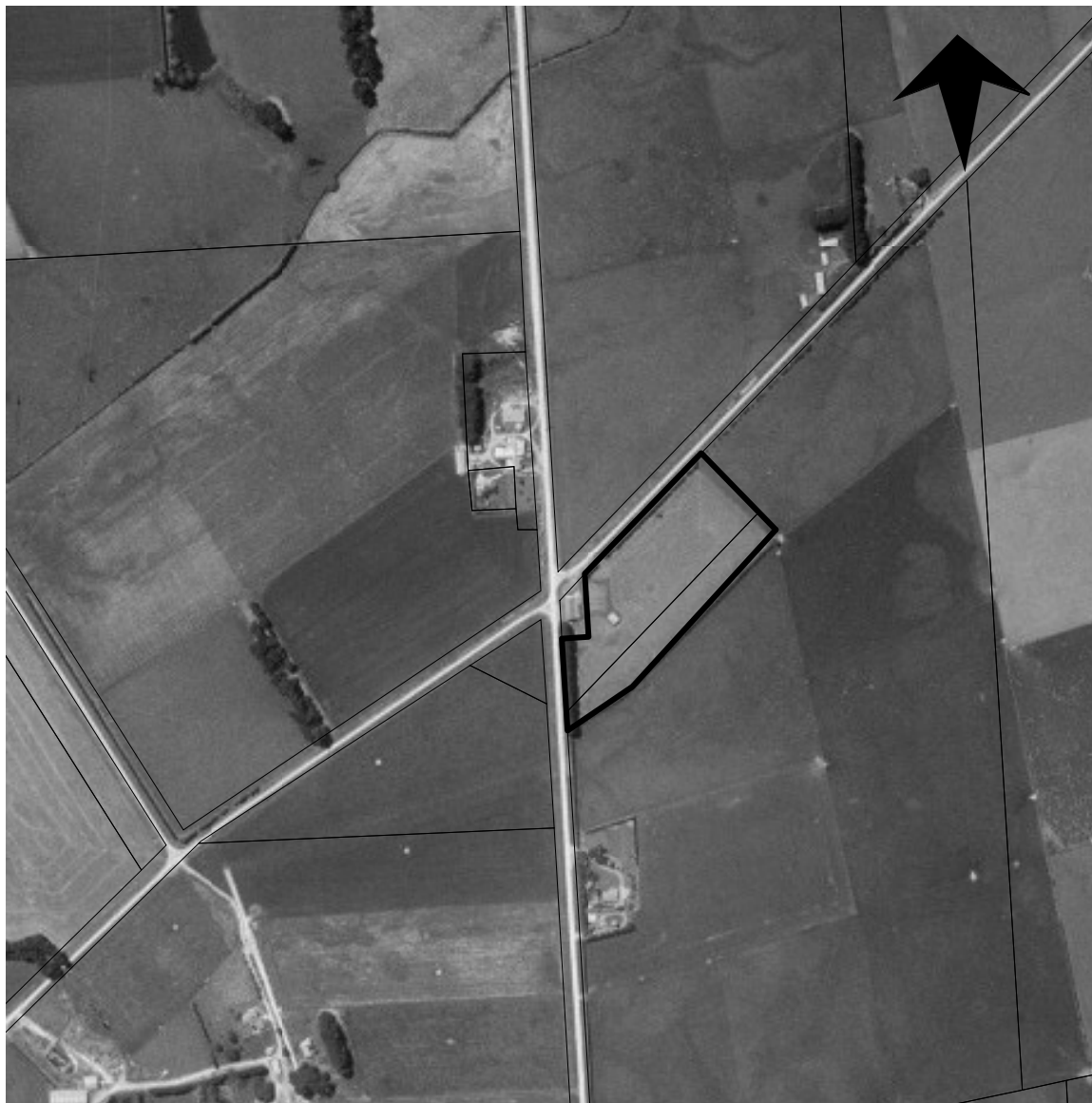
Oteramika Recreation Reserve