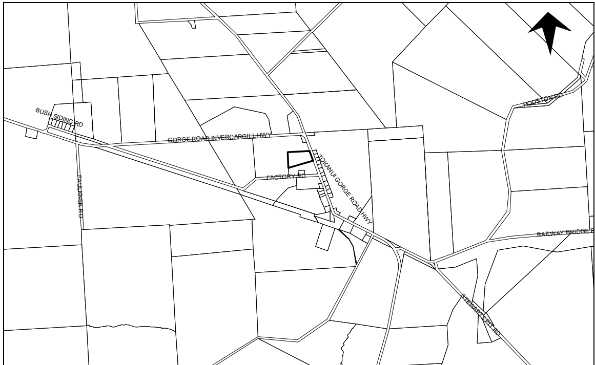
Gorge Road Recreation Reserve