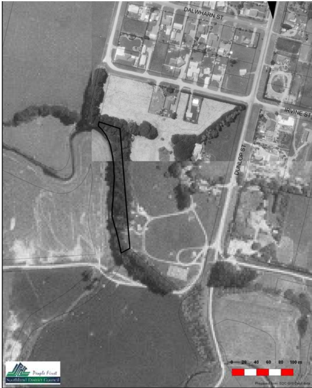
Southern Shelterbelt Reserve