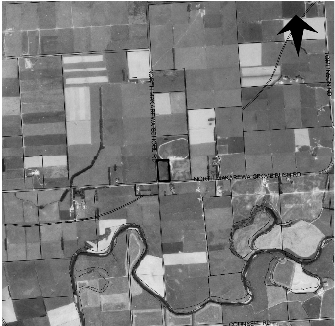
North Makarewa Reserve