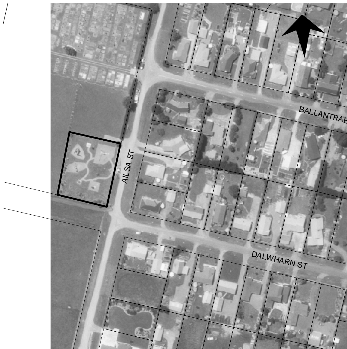
Gwen Baker Park