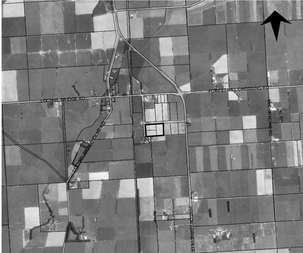
Lochiel Recreation Reserve